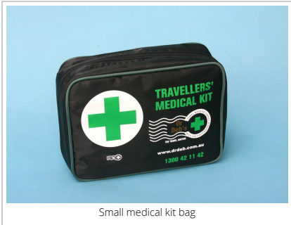
Small medical kit bag

YOU MUST PRINT THIS PAGE AND TAKE IT WITH YOU TO YOUR APPOINTMENT TO ACCESS THIS SPECIAL.